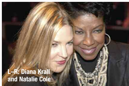
L-R: Diana Krall and Natalie Cole