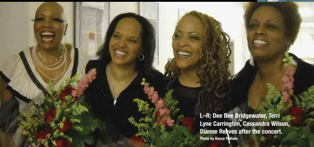
L-R: Dee Dee Bridgewater, Terri Lyne Carrington, Cassandra Wilson, Dianne Reeves after the concert.