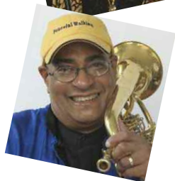
Top to Bottom: Jack DeJohnette, Von Freeman, Charlie Haden, Sheila Jordan, Jimmy Owens.